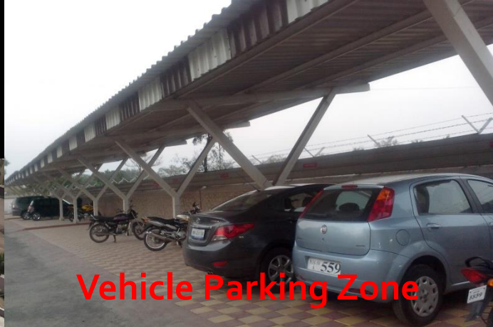
Vehicle Parking Zone