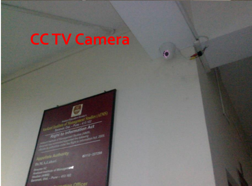
CC TV Camera