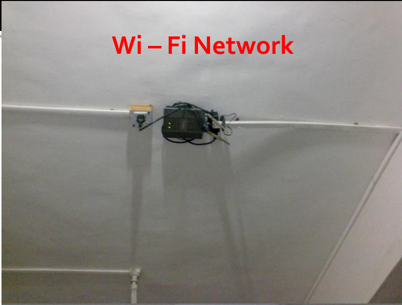
Wi - Fi Network