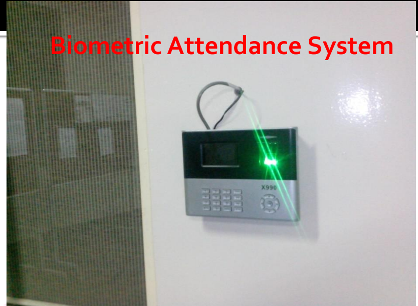
Biometric Attendance System